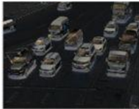
Fig. 5. Difference image.