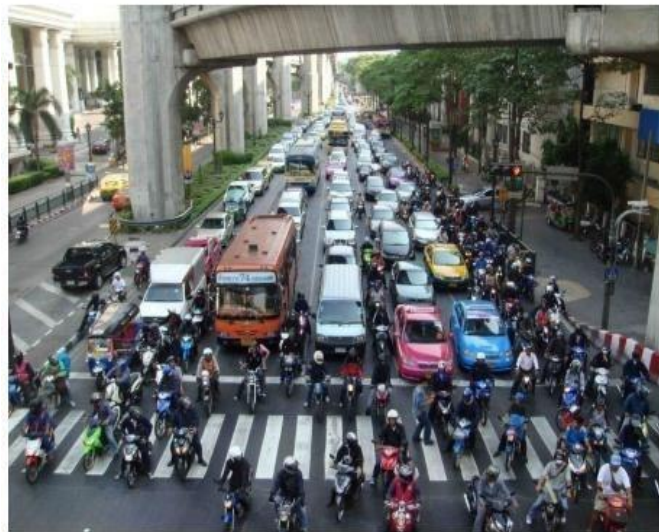
Figure:- 1 Traffic congestion.