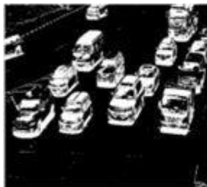
Fig. 7. Binary image.

Density information is uploaded to M2x IoT cloud Platform (Server) using a Wi-Fi connection, this information is accessible by desktop Java application designed to monitor and control the traffic lights by the authoritative of the process. Control commands are uploaded to the cloud platform through the desktop application to be collected by the embedded system and connected via raspberry pi 3to the control the unit consists of a time relay that controls traffic signal times.