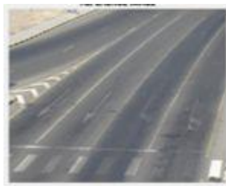
Fig. 3. reference image.

The camera continuously shoots the traffic junction and grabs real-time image as shown in Figure 4. Using digital image processing techniques, Raspberry Pi 3 calculates the difference frame by comparing the real-time image with the reference image shown in Figure 5. Since color information is not important in the process of determining the density of traffic, it is preferable to convert the different frame of the images to grayscale as shown in figure 6. The grayscale image is then converted to a 2 color black white binary image show in figure 7.