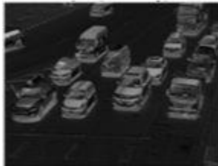
Fig. 6. Gray scale image.

Density information is uploaded to M2x IoT cloud Platform (Server) using a Wi-Fi connection, this information is accessible by desktop Java application designed to monitor and control the traffic lights by the authoritative of the process. Control commands are uploaded to the cloud platform through the desktop application to be collected by the embedded system and connected via raspberry pi 3to the control the unit consists of a time relay that controls traffic signal times.