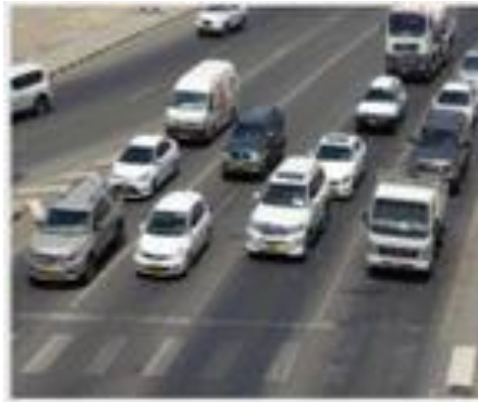
Fig. 4. Real time image.