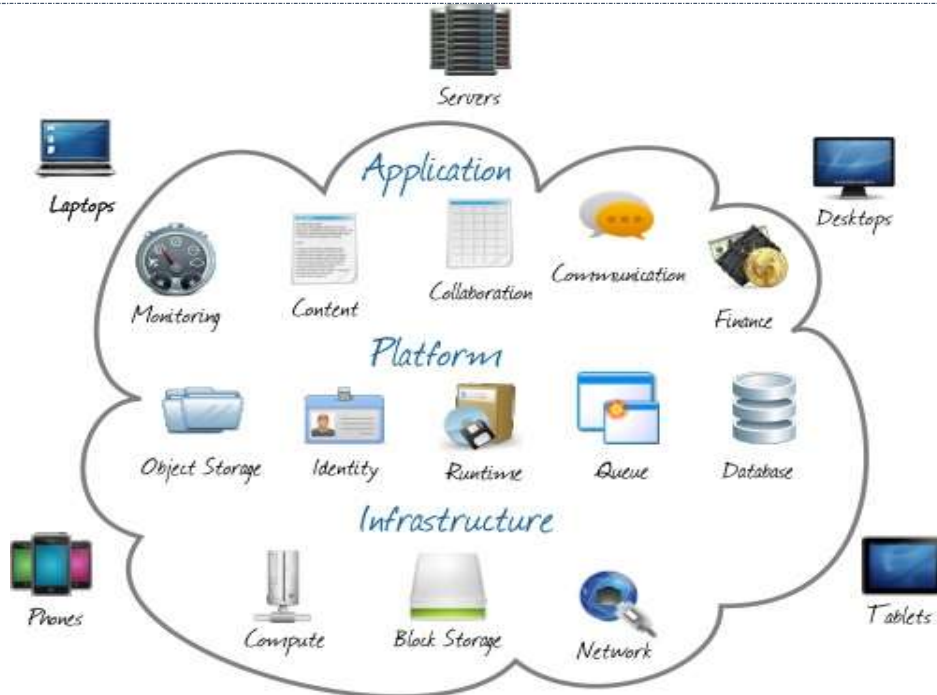
Fig.1.1. Illustration of the Cloud Network

The authors in develop models for transactional databases with eventual consistency, in which an updated data item becomes consistent eventually. Virtualization refers to many different concepts in computer science, and is often used to describe many types of abstractions. In this work, we are primarily concerned with Platform Virtualization, which separates an operating system from the underlying hardware resources. Virtual Machine (VM) refers to the abstracted machine that gives the illusion of “real machine”.