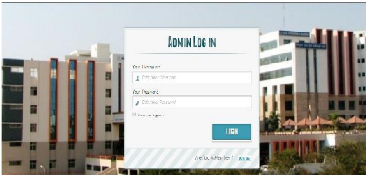
Figure 1. Login Page of web application

The proposed system includes a web application and an android application. Web application is mainly used for the Admin module in which admin will maintain the entire database. The proposed system's design application is implemented in the java programming language on an android operating system. The working is as described as follows. Firstly, the admin has to login to the web application using the username and password provided. If the login is successful then with the help of this application the admin will be able to fill all the details such as student details, bus details, route details and can also change his/her profile and password.