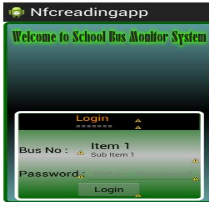
Figure 3. NFC reading application

An NFC Smart phone is placed in each bus handled by the conductor, whenever a school kid steps-in, conductor should scan the NFC tag with NFC mobile that reads the encrypted data and then decrypts it which is further validated. If scanned ID card is not matched then it will show error message. If the data is correct then it will send an SMS to concerned parents mentioning that "Your kid is inside the bus". After reaching the destination again with the help of NFC tag and android device verification is done and an SMS is sent to the respected parents mentioning that "Your child has reached the destination".