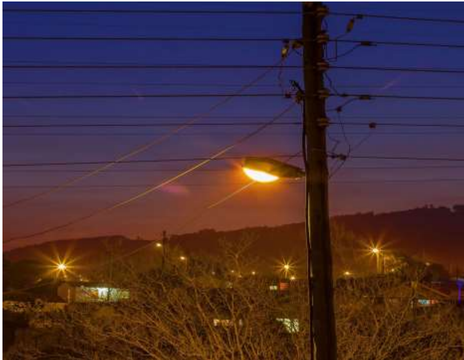
Figure1. An image of conventional street lighting system and its wasting of power and resource